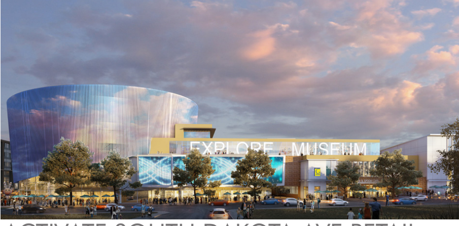
ACTIVATE SOUTH DAKOTA AVE RETAIL